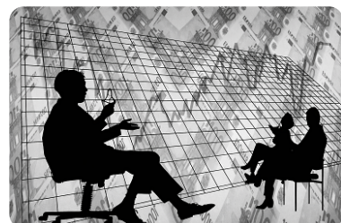
Global Gateway Platform